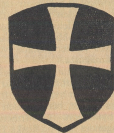
NEWS IN DANISH

Af stoerre opgaver har politiet saaledes ogsaa en del af ansvaret for, at konvojtjenesten mellem Nicosia og Kyrenia forloeber paa betryggende vis. De overvaager konvojen igennem Orta Keuy (den foerste tyrkiske landsby uden for