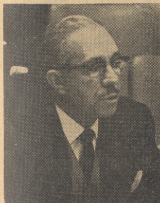
AMBASSADOR ORHAN ERALP OF TURKEY...

Said that Cyprus Government plans were "thwarted" by Turkish Cypriot policy of "self-segregation".