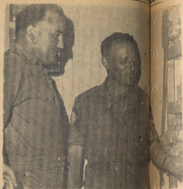
"Middle East Traders" at Paphos