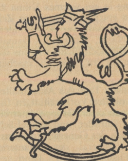
NEWS IN FINNISH