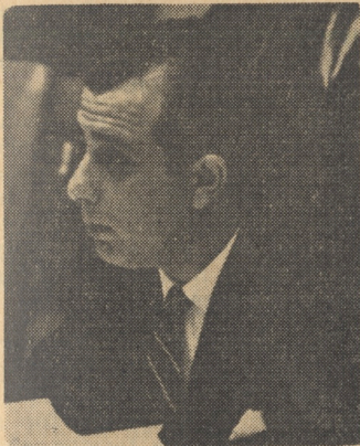
FOREIGN MINISTER SPYROS KYPRIANOU OF CYPRUS...

"If Greco-Turkish talks result in a relaxation of tension between the two countries they would be welcome..."