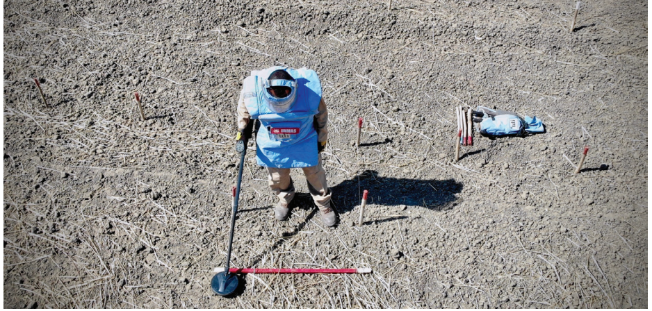
Manual mine clearance in Koladet