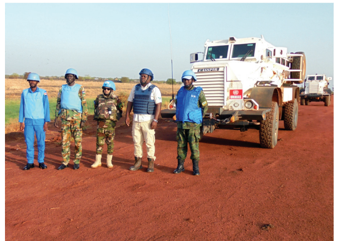
Ground monitoring mission at TS-21 Tishwin