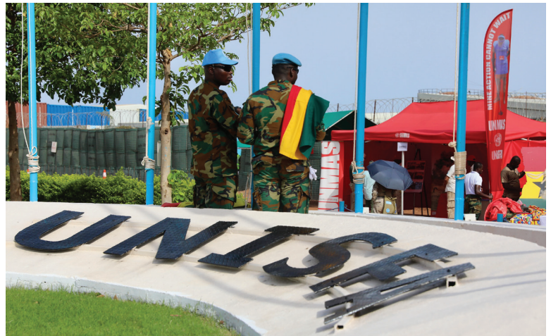
UN Peacekeepers Day at UNISFA

IF YOU SEE AN ITEM OF CONCERN, DO NOT TOUCH IT! CONTACT UNMAS UNISFA IMMEDIATELY! TELEPHONE NUMBER: +211 92 422 4805 (MTN)