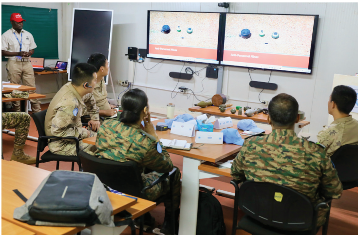
Safety induction training in Abyei

UNMAS completed its collaboration with UNHCR in organizing specifically tailored Explosive Ordnance Risk Education (EORE) for refugees who fled the Sudanese conflict.