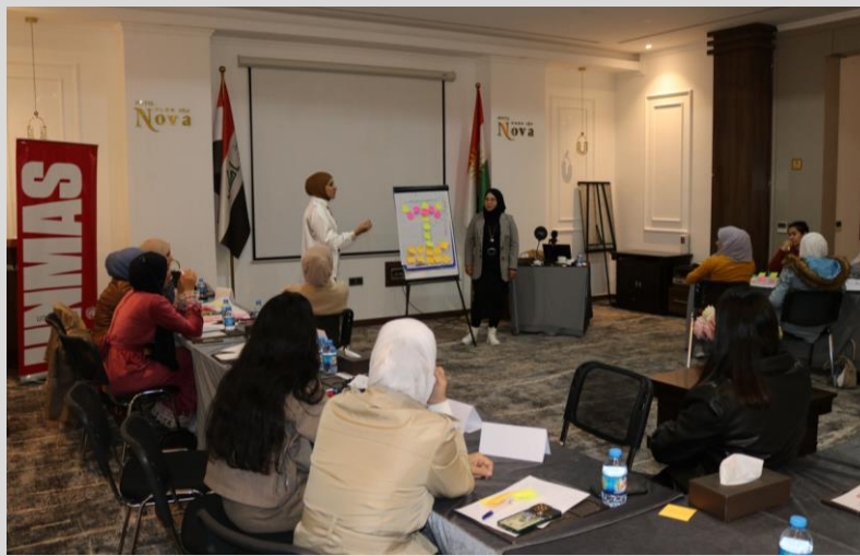
UNMAS Iraq workshop on empowering women working with UNMAS Iraq implementing partners, Erbil, November 2023.