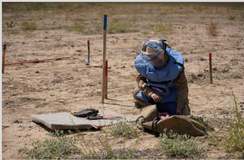
A mine researcher during an explosive ordnance clearance activity. Tel Kaif, October 2023.